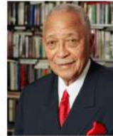
Mayor David Dinkins