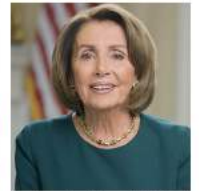
Speaker Nancy Pelosi