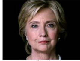
Sec. Hillary Clinton