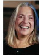
Letty Cottin Pogrebin