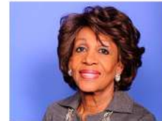
Rep. Maxine Waters