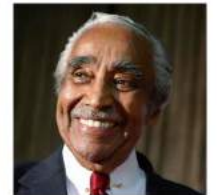
Rep. Charles Rangel